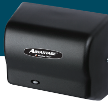
Steel Black Graphite