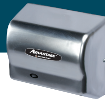
Steel Satin Chrome