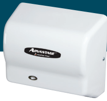
Steel White Epoxy