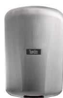
TA-SB Brushed Stainless Steel