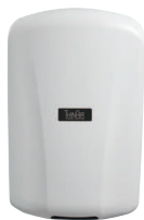
TA-ABS White Polymer (ABS)