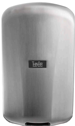
TA-SB Brushed Stainless Steel

MODELS: TA - ABS SB -VOLTAGE (See Chart)